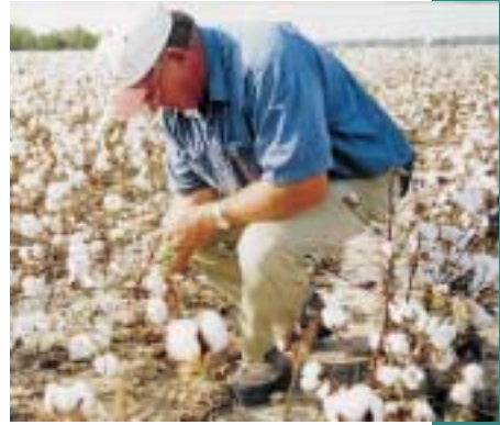
The Cotton Cares program encourages producers to follow good environmental stewardship practices while meeting the objectives of efficient cotton production.

Cotton Cares concepts and program features have been integrated into a system providing cotton producers in North Carolina's Neuse River Basin with tools to cope with "Neuse Rules," which are anticipated soon. These rules address concerns over nutrient content of the Neuse River.