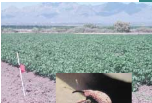
New Mexico State University researchers tested a number of unique strategies that could fit in boll weevil (inset) eradication programs near populated areas.

Researchers at New Mexico State University continued testing a number of techniques to develop eradication methods for fields near sensitive sites in urban areas. From 1999 tests, they determined that use of microencapsulated malathion enhanced control of boll weevil while minimizing potential drift out of the field.