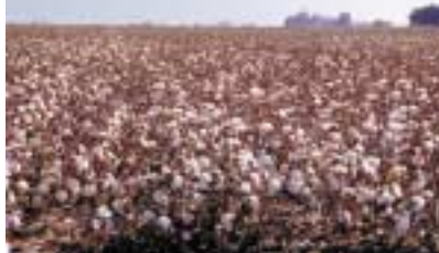
California producer Ken Van Loben Sels' modified planter was used to plant unique ultra-narrow-rows of cotton in a trial system that is suitable for spindle picking.